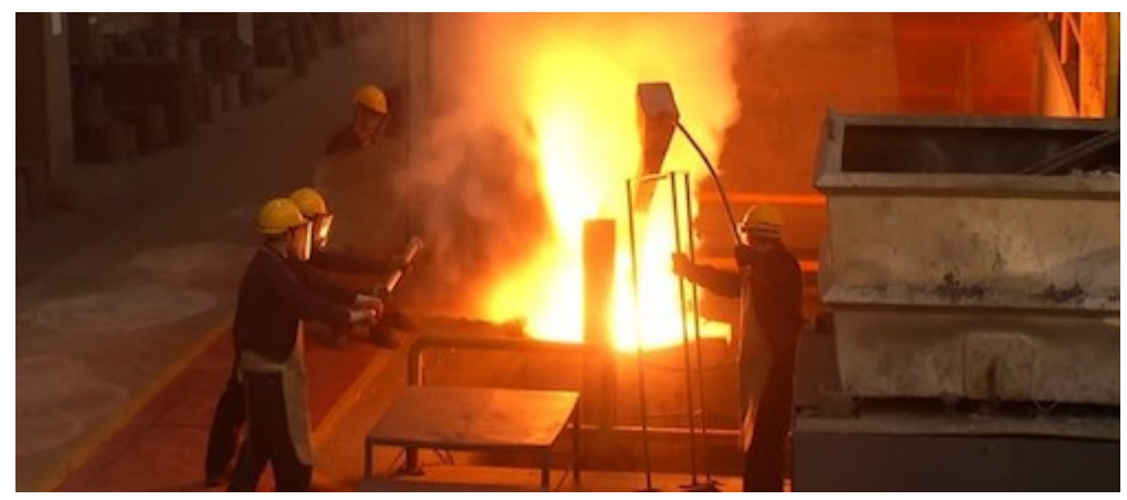
Steel Workers Jobs in Midwest USA Threatened by ITC Trade Case

threatened by the petition filed by Chinese-owned Suniva and German-owned SolarWorld at the International Trade Commission. These two failed foreign-owned companies, after surviving only from U.S. government subsidies, are now asking for the US government to step in and set the price of solar panels at more than double the current market price.