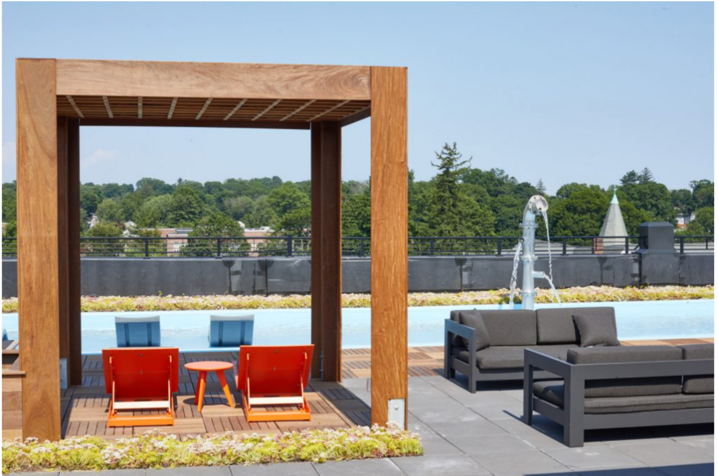
Tenants share a roof deck

"We chose Brim & Crown because of its urban, modern, and hip industrial chic glam design with New York City street graffiti-inspired graphics, convenient location to the train station, lifestyle amenities, and proximity to the historic and trendy SoNo," said Worden.