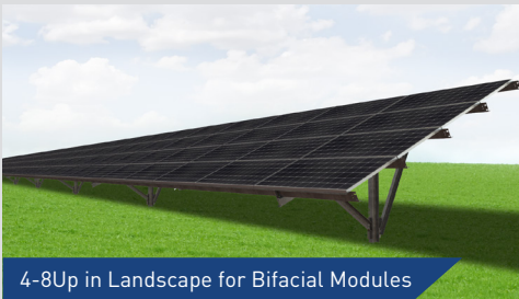
4-8Up in Landscape for Bifacial Modules