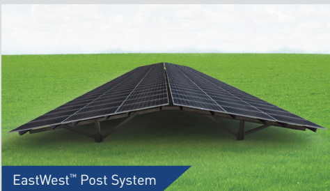
EastWest™ Post System