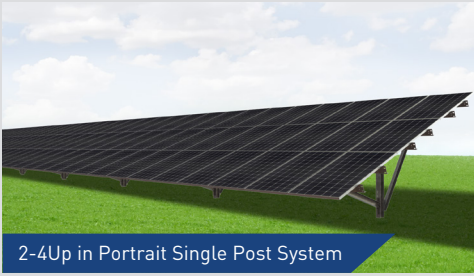
2-4Up in Portrait Single Post System